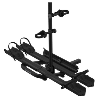
OnRamp LX 2" 8002756